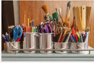
Arts & Craft